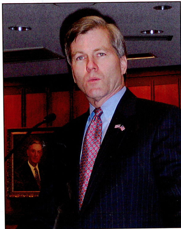
Commonwealth Attorney General Bob McDonnell

“It is a great honor for me to be with you today,” said Commonwealth Attorney General Bob McDonnell. In truth, the honor was mutual. The Attorney General accepted an invitation to speak at our promotion ceremony.