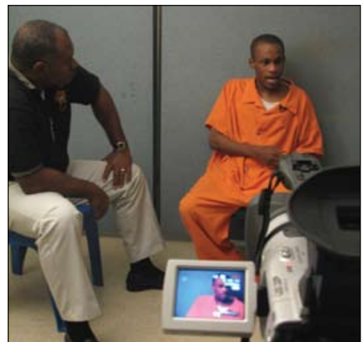
“Inmate Admits Mistake”: The making of a movie produced by the Newport News Sheriff’s Office using inmates talking about their mistakes.