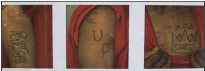
This tattoo reveals gang membership and was taken during the booking process. MOB stands for Member of Bloods. The five pointed crown represents People Nation, and alliance of gangs. Piru is a California street gang that became one of the founding members of the Bloods.