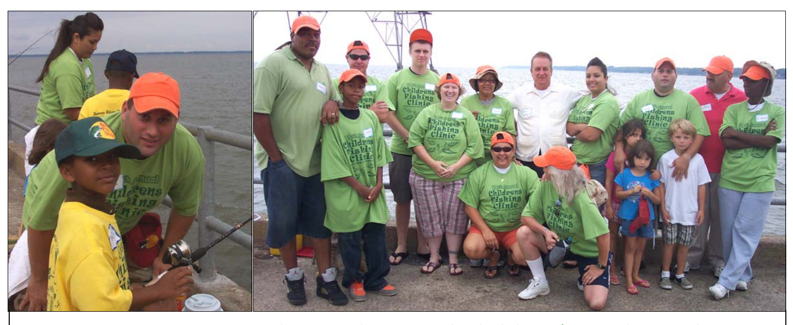
REELING-IN FUN at the 14th Annual Children's' Fishing Clinic !!! More than a dozen deputies and civilian employees happily took the bait — hook, line and sinker to volunteer July 18 at the James River Bridge Fishing Pier.