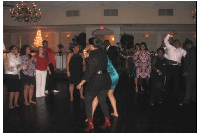
Kicken' it on the dance floor!