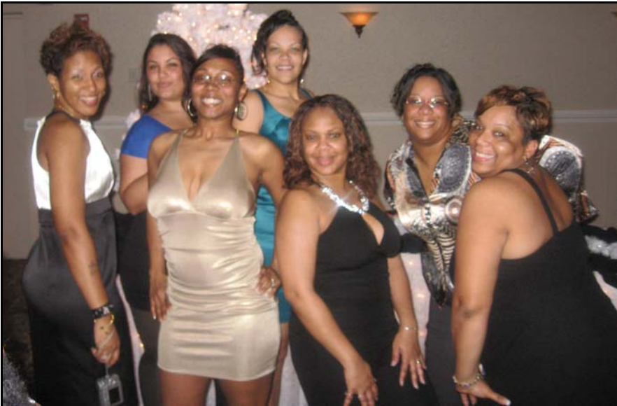
The Ladies of the Newport News Sheriff's Office trade-in their Class-B's for CLASSY!

2009 ended with the 3RD ANNUAL HOLIDAY PARTY! This year it was held at the Point Plaza in Newport News. The evening included a DJ and a live band.