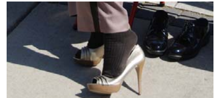
Are You Man Enough?... Read More... Page 3