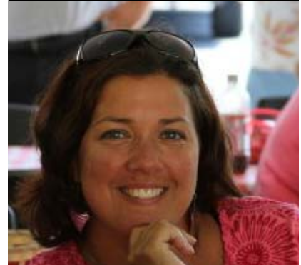
Family Fun at Annual Picnic More Photos... Page 6