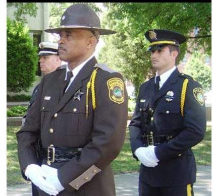
City Says Goodbye at Annual EPTF Memorial Service Read More... Page 7