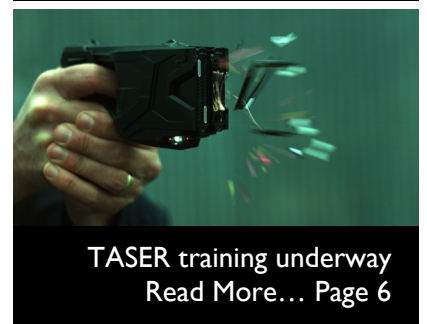
TASER training underway Read More... Page 6