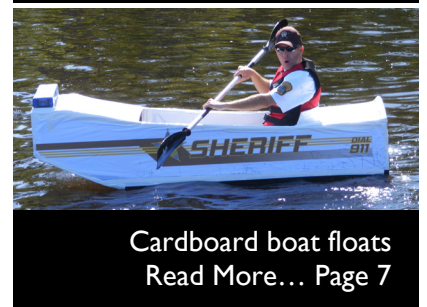
Cardboard boat floats Read More... Page 7