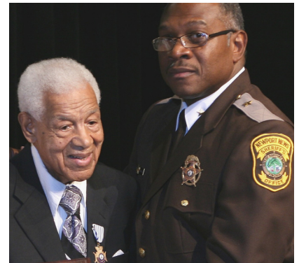
Volunteer of the Year Read More... Page 6