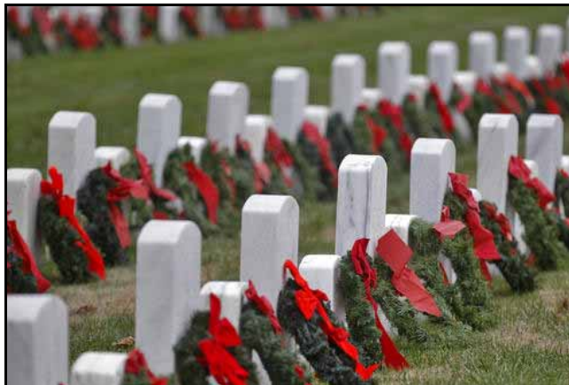
Wreaths line the graves at Hampton National Cemetery.

The Navy Wives Club was able to afford 7,000 wreaths through donations. ★