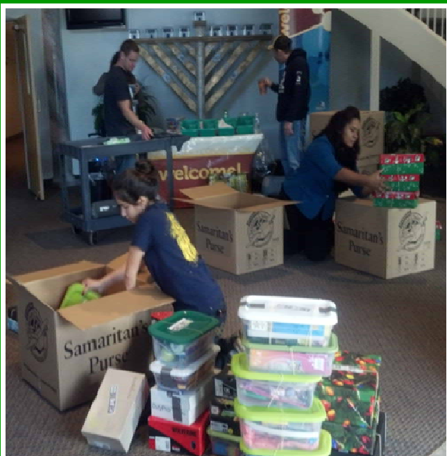
Local collection point before shipment to Samaritan's Purse in North Carolina