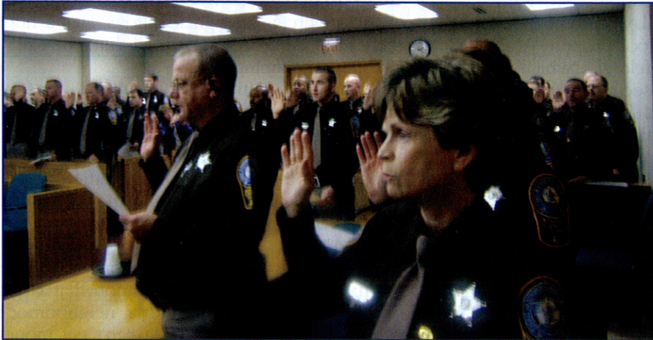
Roanoke City Sheriff's Office Deputies take their oath of office.