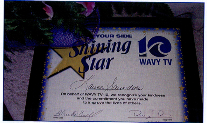
Shining Star plaque awarded Sergeant Laura Saunders

with a rare brain cancer. Ependymoma is a tumor that affects the central nervous system. The location of the tumor made it impossible for doctors to remove the entire growth. There started an arduous path of treatments. Not all expenses were covered by health insurance.