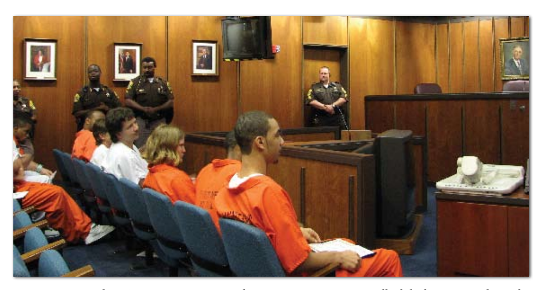
Inmates earning their GED participate in graduation ceremony at City Hall while deputies stand guard.

Work release is another avenue being pursued. To