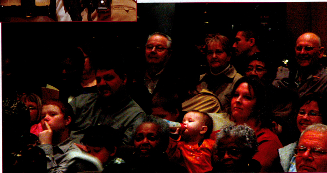
An audience of friends, family and colleagues showed their support at the NNSO 3rd Annual Promotions and Awards.